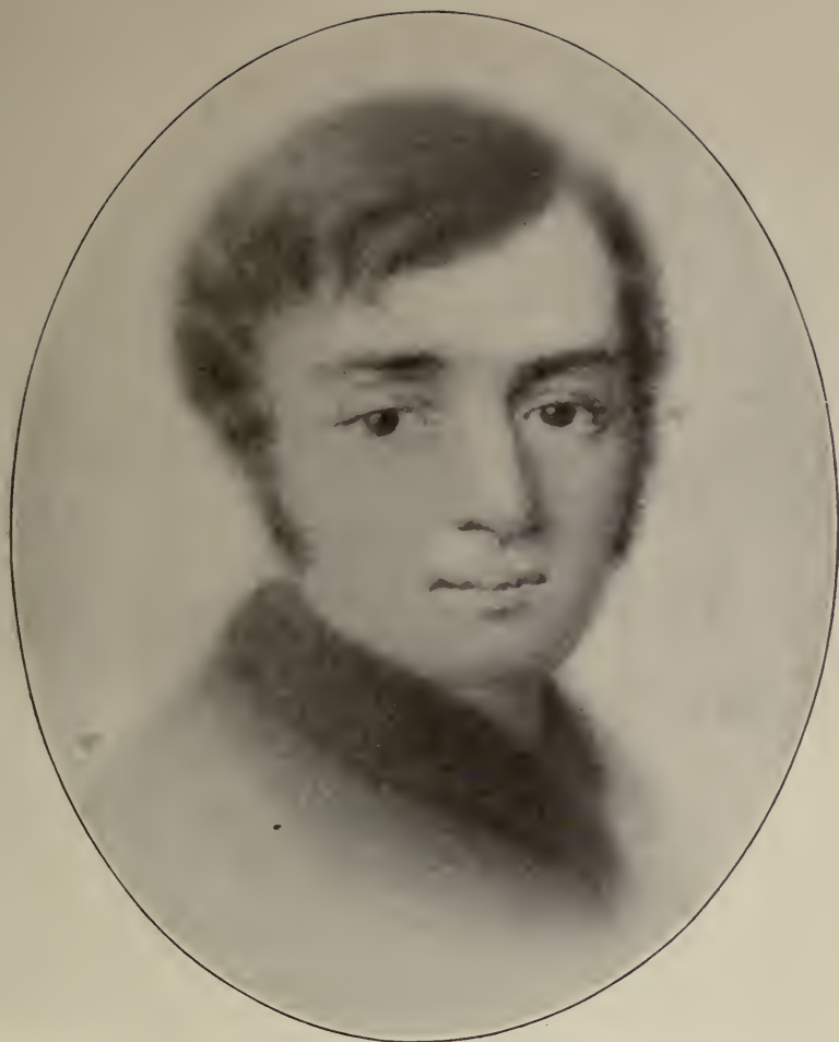
JOSEPH NICOLAS NICOLLET.